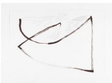
Abraham Cruzvillegas Primate Change Denial 12, 2020 ink and graphite on paper 35.5 x 51 cm. 14 x 20 1/8 in. (TDA12265)