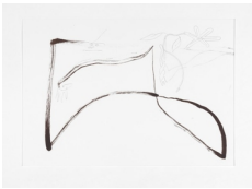
Abraham Cruzvillegas Primate Change Denial 5 , 2020 ink and graphite on paper 35.5 x 51 cm. 14 x 20 1/8 in. (TDA12258)