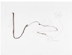
Abraham Cruzvillegas Primate Change Denial 10, 2020 ink and graphite on paper 35.5 x 51 cm. 14 x 20 1/8 in. (TDA12263)