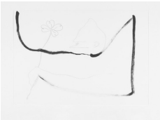
Abraham Cruzvillegas Primate Change Denial 15 , 2020 ink and graphite on paper 35.5 x 51 cm. 14 x 20 1/8 in. (TDA12268)