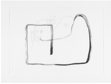
Abraham Cruzvillegas Primate Change Denial 2 , 2020 ink and graphite on paper 35.5 x 51 cm. 14 x 20 1/8 in. (TDA12255)