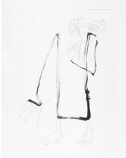
Abraham Cruzvillegas Primate Change Denial 8, 2020 ink and graphite on paper 51 x 35.5 cm. 20 1/8 x 14 in. (TDA12261)