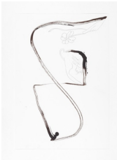
Abraham Cruzvillegas Primate Change Denial 3 , 2020 ink and graphite on paper 51 x 35.5 cm. 20 1/8 x 14 in. (TDA12256)