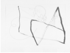
Abraham Cruzvillegas Primate Change Denial 1 , 2020 ink and graphite on paper 35.5 x 51 cm. 14 x 20 1/8 in. (TDA12254)