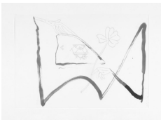
Abraham Cruzvillegas Primate Change Denial 6 , 2020 ink and graphite on paper 35.5 x 51 cm. 14 x 20 1/8 in. (TDA12259)