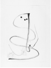
Abraham Cruzvillegas Primate Change Denial 13 , 2020 ink and graphite on paper 51 x 35.5 cm. 20 1/8 x 14 in. (TDA12266)