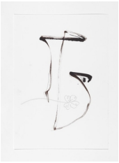
Abraham Cruzvillegas Primate Change Denial 14 , 2020 ink and graphite on paper 51 x 35.5 cm. 20 1/8 x 14 in. (TDA12267)