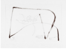
Abraham Cruzvillegas Primate Change Denial 7, 2020 ink and graphite on paper 35.5 x 51 cm. 14 x 20 1/8 in. (TDA12260)