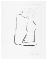
Abraham Cruzvillegas Primate Change Denial 4 , 2020 ink and graphite on paper 51 x 35.5 cm. 20 1/8 x 14 in. (TDA12257)