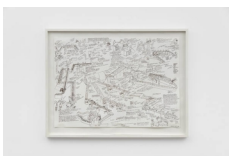
Identification/Sorting/Separation , 1998 signed and dated recto ink on paper 50 x 70 cm. 19 3/4 x 27 1/2 in.