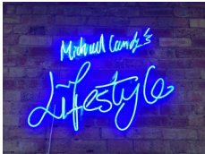
Michael Landy's Lifestyle , 1998 fluorescent sign, transformer 67 x 94 cm. 26 3/8 x 37 1/8 in.