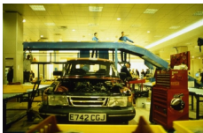
Break Down , 2001-2014 Mini DV transferred to digital video, sound 16 min 38 secs