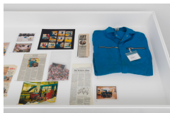
Display table Selection of archive material illustrating the development of Break Down