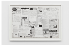
At a Routine Everyday Level, People Don't Feel the Need to Question the Validity of Consumerism as a Way of Life, the Dreams That are Engendered in Consumerism Give Meaning to People's Lives , 2002 signed and dated recto ink on paper 82 x 126.5 cm. 32 1/4 x 49 3/4 in.