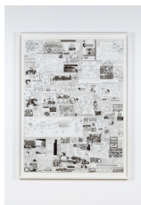
The Subject of Consumption , 1999 signed and dated recto ink on paper 137 x 101 cm. 54 x 39 3/4 in.

11 DUKE STREET, ST JAMES'S, LONDON SW1Y 6BN