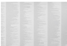
Break Down Inventory , 2001/2016 wallpaper, film dimensions variable