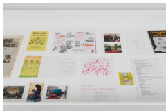
Display table Selection of archive material illustrating the development of Break Down