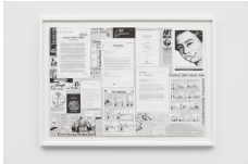
Compulsory Obsolescence , 2002 signed and dated recto pen, ink on paper 70 x 99.5 cm. 27 1/2 x 39 1/8 in.