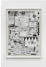
Sustainable Development , 1999 signed and dated recto pen, ink on paper 99 x 69.5 cm. 39 x 27 3/8 in.