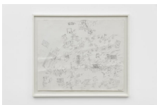
Michael Landy's Lifestyle , 1997 signed, dated recto ink on paper 68.5 x 82 cm. 27 x 32 1/4 in.