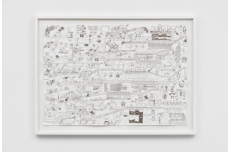
P.D.F. (Product, Disposal, Facility) , 1998 signed and dated recto ink on paper 69 x 99.5 cm. 27 1/8 x 39 1/8 in.